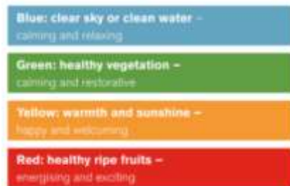
Fig. 4: Colors that affects the emotions (Birren, 2006).