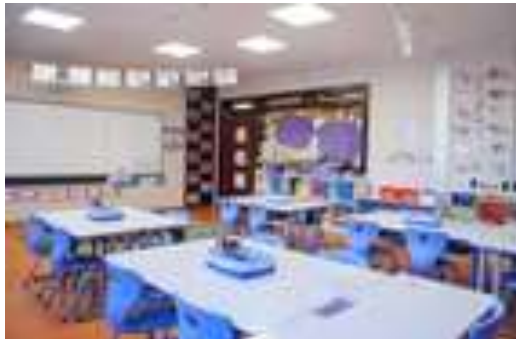
Fig. 9: Malvern Collage primary classroom from another perspective