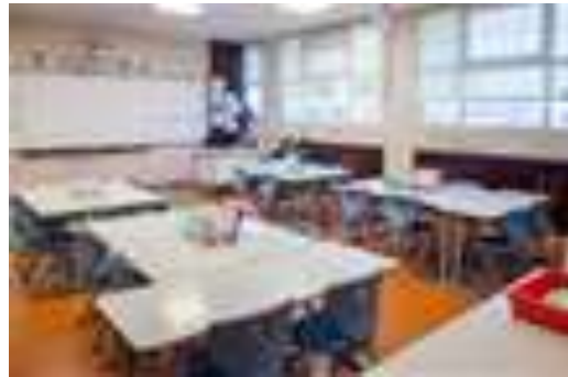
Fig. 8: Malvern Collage Primary classroom.