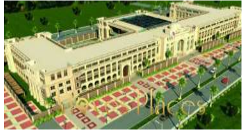
Fig. 6: The main gate for Malvern College School.

The chosen case study is an international school called "Malvern Collage Egypt" one of the high quality standard schools established in 2016 and located in the New Cairo, Egypt. The project is a large U shaped building surrounded by a green area and large swimming pool. The school education levels starts from kindergarten till the high school level. The criteria for choosing this school as it is one of the few schools in Egypt that adapted some of the Biophilic elements; it focused on enhancing the student's comfort and satisfaction through the use of natural design elements inside the classrooms. In addition to the overall conditions of the school design. In order, to be an example for other schools to adapt a new design ideas in the future to enhance the student's comfort The data collection was classified into two steps .The first step of collecting the data was a field survey to the schools' campus to take the possible photos for the primary classrooms in the real conditions and taking notes. The second step was using these photos and notes to fill the deduced matrix in order to identify how many element of the Biophilic features are present. Finally, according to the filling of the matrix, (table 3) will identify the Biophilic elements that are present in the classroom and what should be added to enhance the Biophilic design natural elements inside the school.