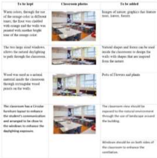
Table 5: Analysed the present Biophilic elements and what are the recommended elements to enhance the Biophilic design inside the classroom ,according to the case study filling matrix.