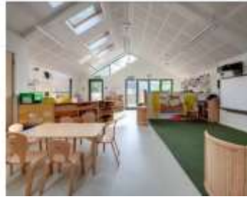
Fig. 1:Daylighting in a classroom, Carshalton, UK (Gower,2019).

There are different studies that allows the using of daylight strategies in classrooms and determined the student’s impact. For example, a study by Yacan (2014) shows that there is a huge impact on the student’s behavior and cognitive skills, due to the effect of the daylight on the students in the classrooms. Gelfand and Freed have also asked for the use of daylight in classrooms in order to allow the students to connect with the outdoor environment to enhance the student’s and teacher mood (2010). Figure (1) shows an example for daylighting in a classroom, Carshalton, UK