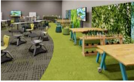
Fig. 2: Classroom design by Stephen Gower in 2019.