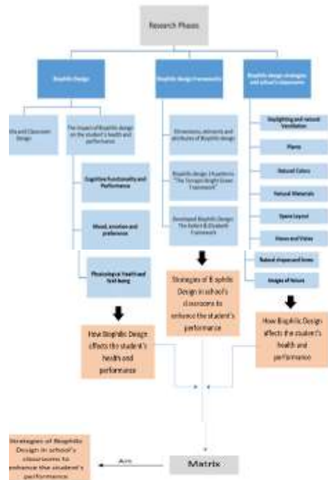
Fig. 10: Research Phases

elements inside the classrooms to enhance the student's comfort. This case study was used to support the aim of the research to start implementing the Biophilic design elements inside the schools. The Biophilic design elements don't based on the school quality standard, they are sustainable elements that are affordable to be used through different types of schools (international or even public). It is a new design strategy that started to be used in all over the world and expected to be more desired for the future.